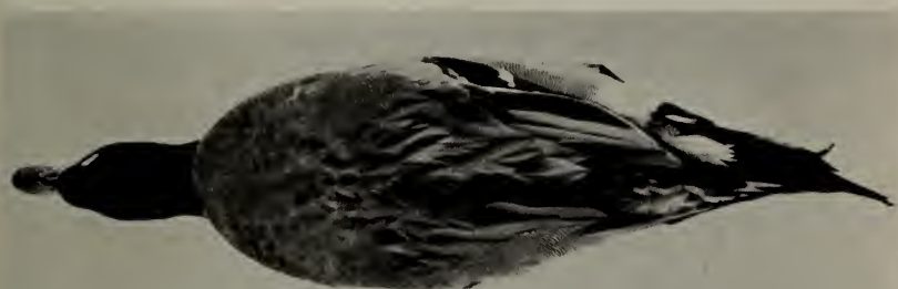
Dorsal view of hybrid showing well developed scapulars and tail feathers, and vermiculations of mantle and back.

From the above details it can be seen that all the characters of the hybrid can be found in the males of the parental species. In fact the hybrid can be said to be intermediate between the parental species with perhaps slightly more Pintail than Chiloe Wigeon characters. The white face of the Chiloe Wigeon has gone, as have the breast vermiculations of that species. The bright russet colour of the flanks of the Chiloe Wigeon are replaced by black and grey vermiculations, but this colour, reduced to pale russet (mars brown of Ridgway), occurs on the upper breast, sides of breast and upper mantle of the hybrid. The metallic green stripes from eyes to nape that are characteristic of the Chiloe Wigeon are present and unchanged in the hybrid. The most noticeable Pintail characters are the well developed scapulars and tail feathers, and the vermiculations on the flanks and dorsal surface. In measurements the hybrid is much closer to the Pintail than to the Chiloe Wigeon. There are no characters in the morphology of the hybrid than can be said to be of phylogenetic significance.